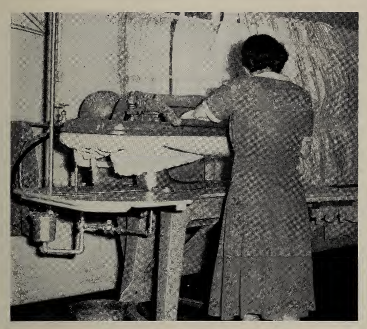
A corner in the Mercer laundry.